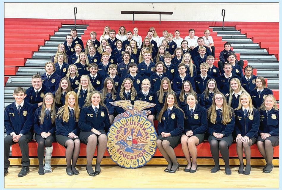
The Warrenton FFA chapter gathered its full membership for a photo at Warrenton High School earlier this year.