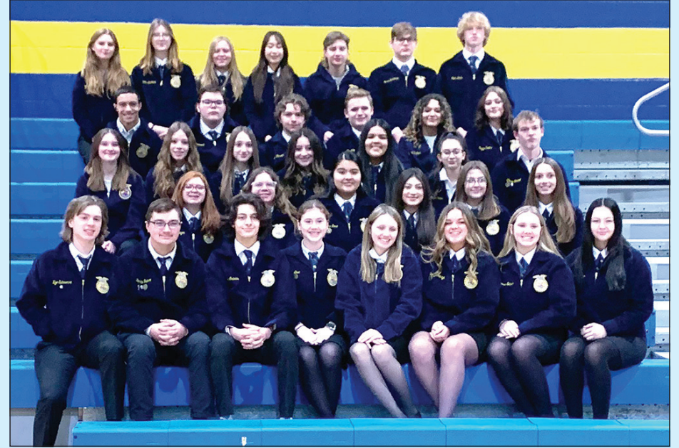
Members of the Wright City FFA chapter gather for a full group photo at Wright City High School.