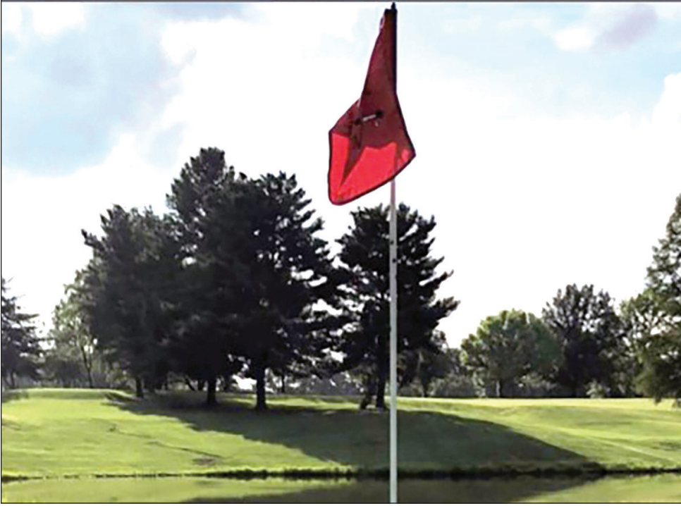
Loutre Shore Golf Course is located 1.5 miles north of Hermann.