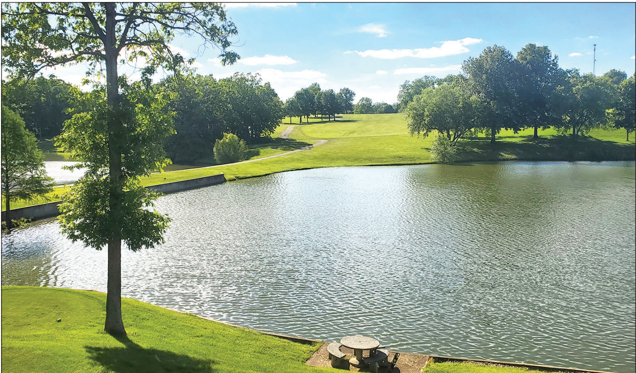
Country Lake Golf Course is planning multiple changes to the property.