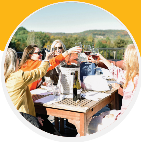
▲ Winery Tours