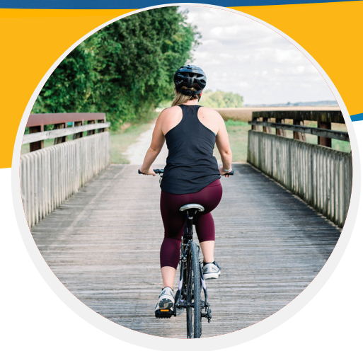
▲ Katy Trail Tours