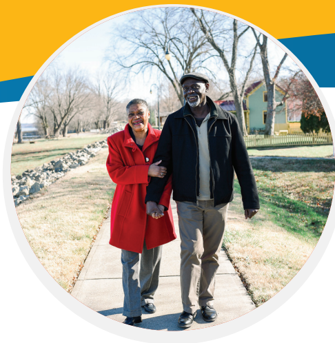
▲ Lewis & Clark Exploration