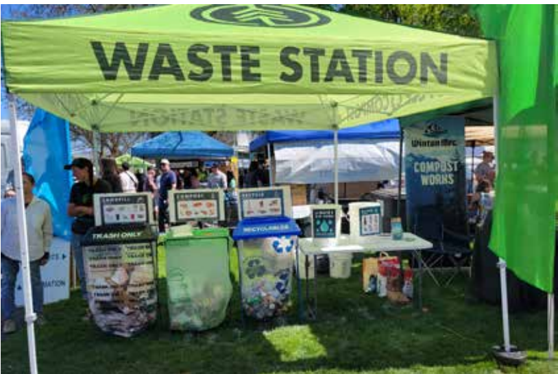
Visitors and vendors at the Chelan Earth Day Fair took items they want to dispose of to the Waste Station at the fair. They could choose from Trash Only (Landfill), Compost, Recyclable Items, Liquid and Glass.