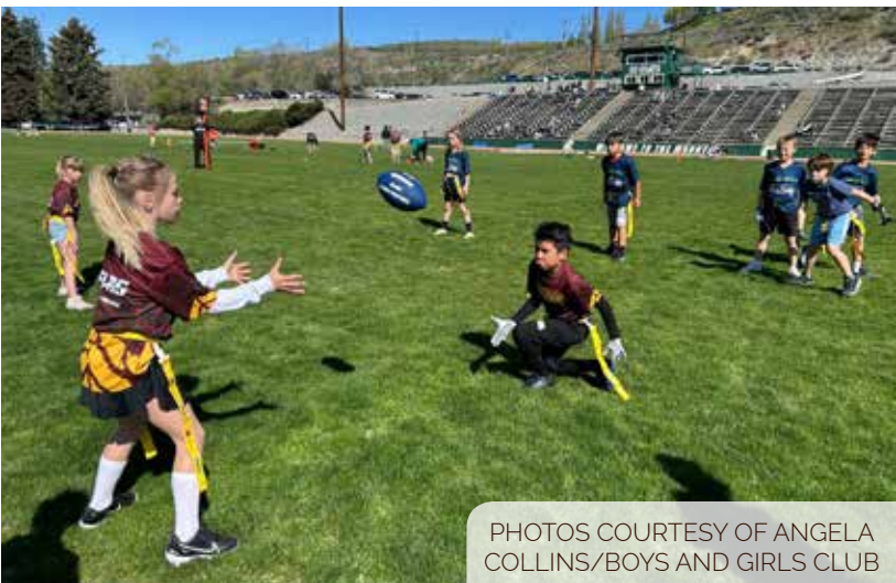
Two Commanders keep the ball away from the Seahawks defense.