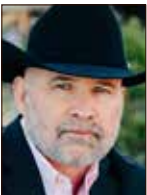
From the Publisher

neighbor during a tough time had stuck with him. He said he was about 16, struggling with school, confidence, and life in general. One afternoon, a neighbor asked him to help mow the lawn. Afterward, the man handed him a glass of lemonade, clapped him on the shoulder, and said, "You're a good worker. I hope you know that." It was such a small moment – no lecture, no grand advice.