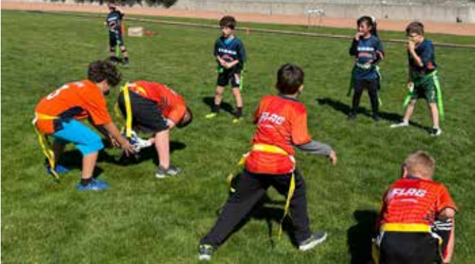
The Broncos’ center hikes the ball to the QB as the legendary Bears defense gets ready for the chase.

The kids will get to keep those NFL jerseys after the season ends, though. It’s a great reminder of participation in something that more than three-quarters of a million kids across the country will do this year. NFL Flag has even become a proving ground for female athletes to compete at the college level – not that any of the little 11-year-olds at Sargent Field are worrying about that just yet.