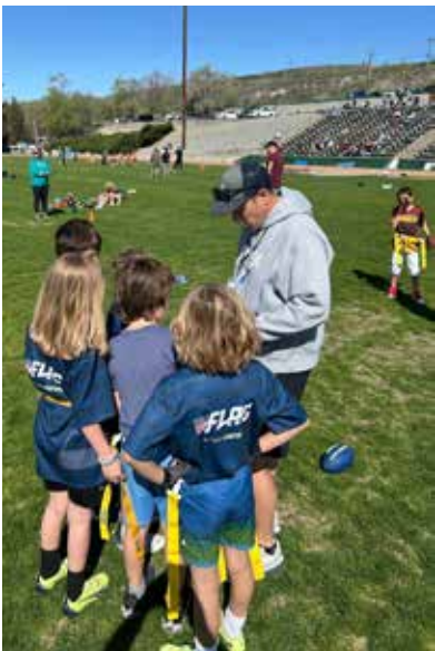
Players huddle with the coach to discuss strategy.