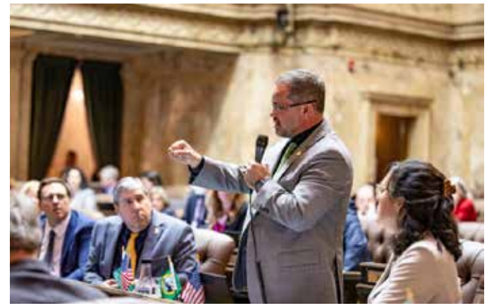
The Washington State House of Representatives convenes for floor debate.