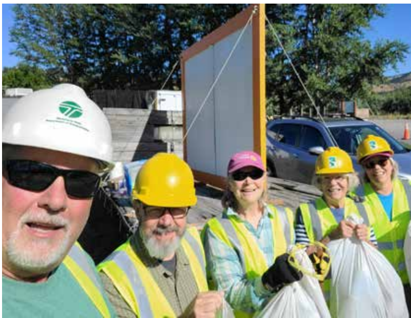
Leavenworth Rotarians clean up Highway 2.