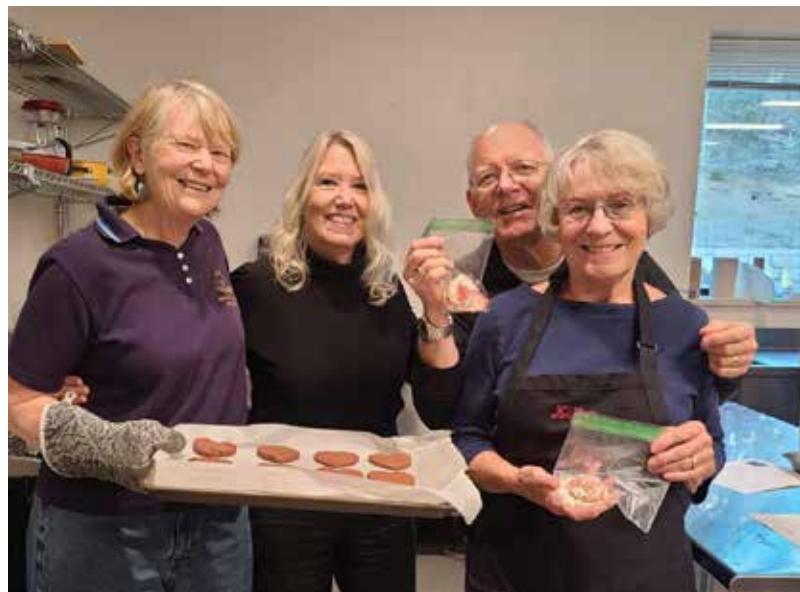
Rotarians bake Valentine's Day cookies for Mountain Meadows Senior Living residents.