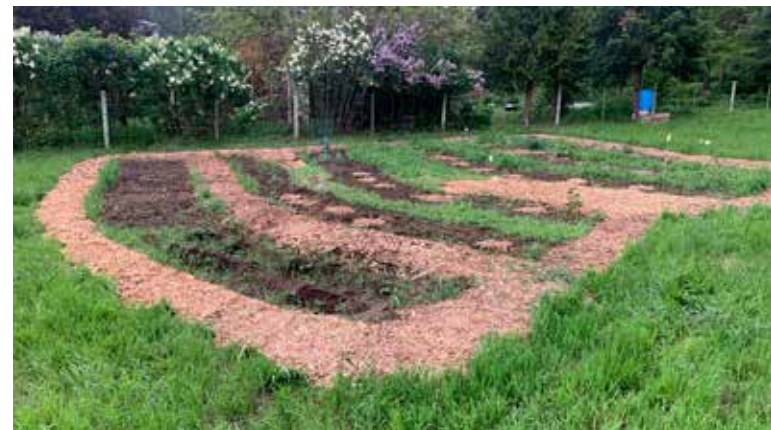
An eighth of an acre up Eagle Creek Road was a grassy field before Eriksen tilled the grass, sheet mulched the pathways, installed a sprinkler, sowed seeds, and applied several rounds of compost tea.