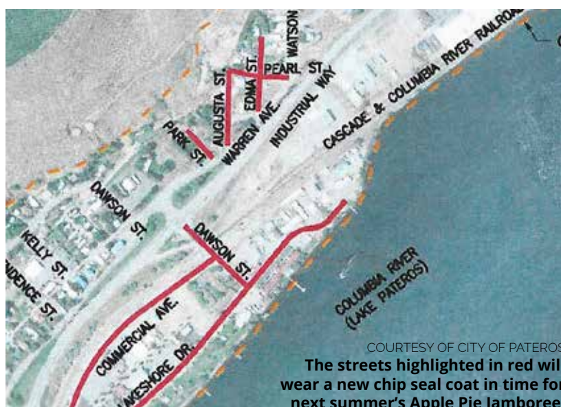
The streets highlighted in red will wear a new chip seal coat in time for next summer’s Apple Pie Jamboree.