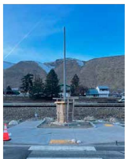
This pole marks the site for the new Recreation Base Camp sign.