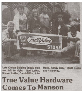
Lake Chelan Building Supply staff hold a True Value Hardware banner.

"I was 52 and really was not looking to do something else, but I also knew the opportunity of them purchasing us was not going to come around many