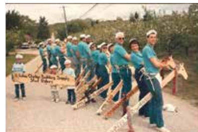
Lake Chelan Building and Supply staff show off their "stud" horses.