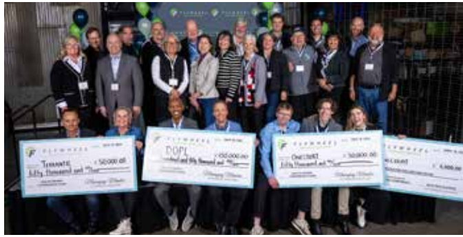
Group photo of 2024 Flywheel Conference winners with the Flywheel Angel Network.

Applicants submitting a complete application will receive a 50% discount on conference tickets and recognition for their