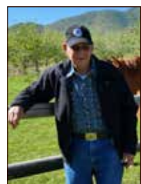
Jim Bee Stamps