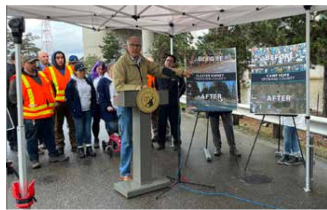
Gov. Jay Inslee released his 2024 budget proposals surrounding housing and homelessness programs at the site of a former encampment in Seattle last December.