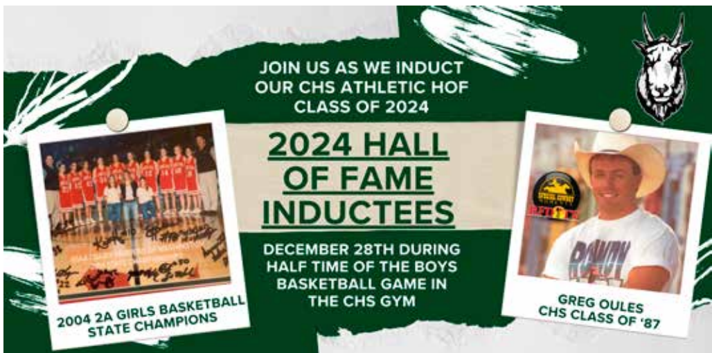
The 2024 inductees join 27 other athletes, coaches, or teams enshrined in the school Hall of Fame.