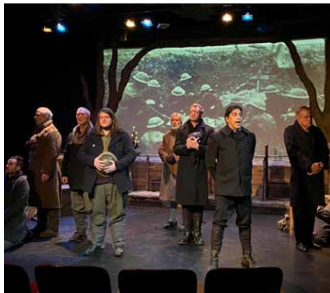
The music theater’s performance of “All is Calm” in 2022. The return of the production will see many of the same cast members.

Taylor Caldwell: 509-433-7276 or taylor@ward.media