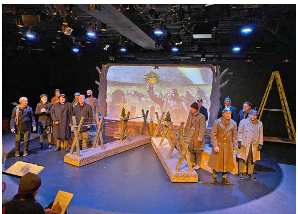
Dress rehearsal for the 2024 return of “All Is Calm: The Christmas Truce of 1914.” The production returns this December two years after its first 2022 performance.