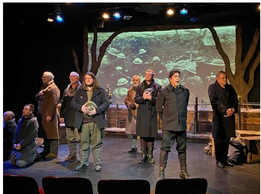
The music theater’s performance of “All is Calm” in 2022. The return of the production will see many of the same castmembers.