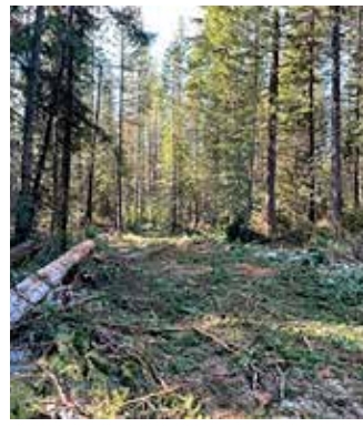
An area of the Raging Timber sale where tree thinning was started earlier this fall.