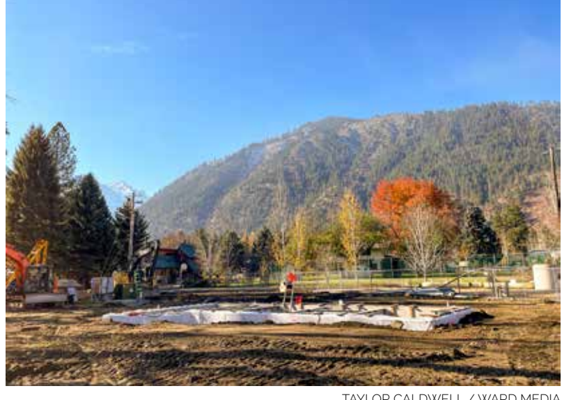
The pressurized pump system is being built at the end of Shore Street, at river mile 1.9 on Icicle Creek