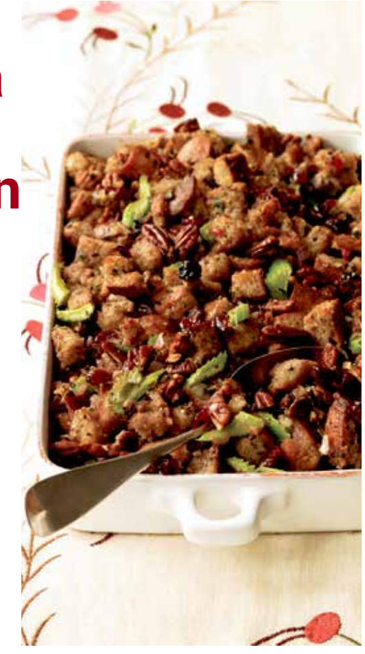
Preparation time: 30 minutes Cooking time: 50 minutes Resting time: 5 minutes

Stuffing is a dish many celebrants can't wait to see on the holiday dinner table. For hosts trusted with preparing holiday meals, the beauty of stuffing lies in its versatility. A host of unique ingredients can be added to holiday stuffing without adversely affecting the popularity of this beloved side dish. In fact, adding some unique ingredients can make people love stuffing even more. Such could be the case with this recipe for "Pecan-Cherry Bread Stuffing" from Lines+Angles.