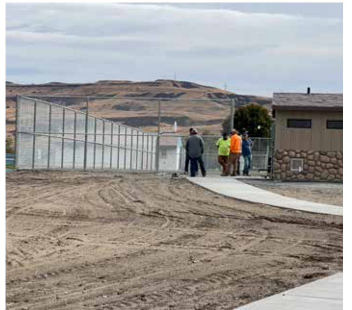
MIKE MALTAIS/WARD MEDIA

A safety pad will be installed around new playground equipment.