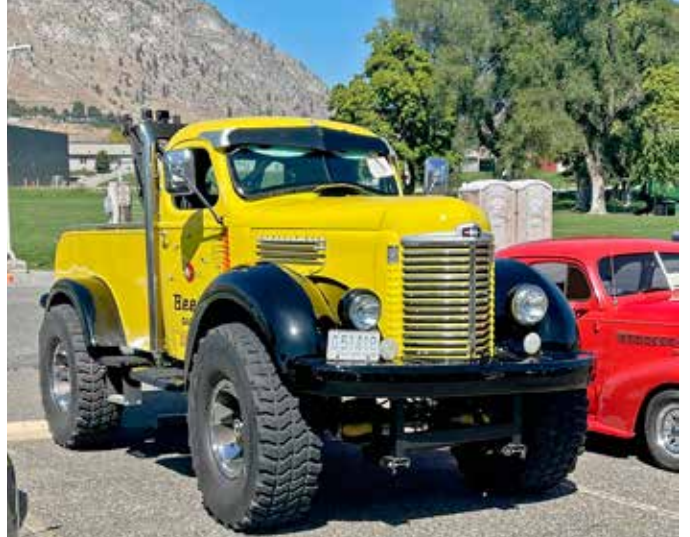
The Beeline, a 1948 International KB-6 truck, won Best of Show.