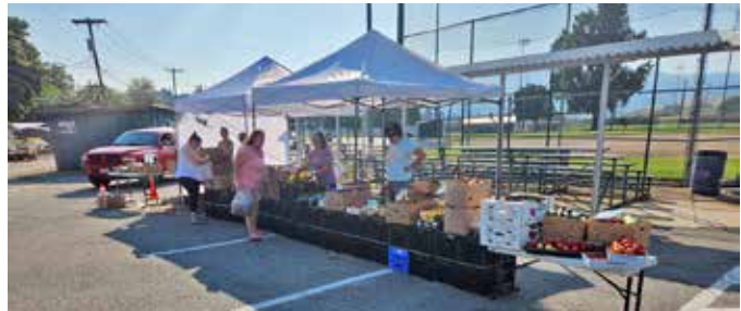
The Lake Chelan Food Bank set up a produce stand when they had excess fruits and vegetables.