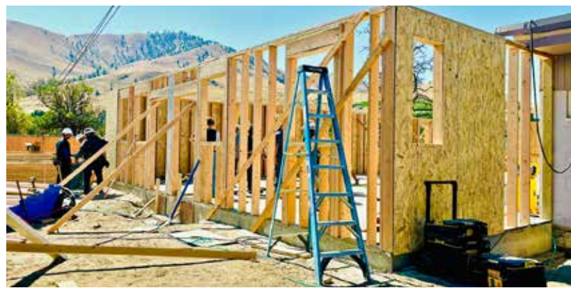
Construction is on schedule to be finished by spring of 2025.