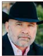
From the Publisher

Compassion. It's a word we hear often, but when was the last time you truly felt it? Not just a fleeting moment of sympathy, but a profound understanding of another's pain that moved you to action. In a world reeling from division, where the homeless are invisible on our streets and neighbors struggle behind closed doors, compassion seems in short supply. Yet it may be our most powerful, untapped resource for change. What if, instead of looking away, we dared to look closer?