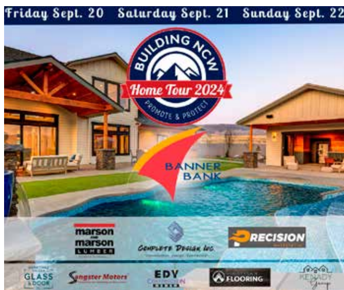
Building NCW (BNCW) welcomes community members to take an inside look at the unique work local builders are doing in various NCW communities.

"[Chefs on Tour] kicks off the [Home Tour], trademarked about 12 years ago" she explained. "And basically, you get a taste of what a chef, or caterer, or a new restaurant, or something like that can do."