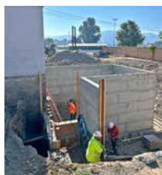
Construction is underway to build a bigger home for Chelan Valley Hope.

The covered drive-thru will help protect the food bank workers from harsh weather conditions and safeguard the boxes of food as well.