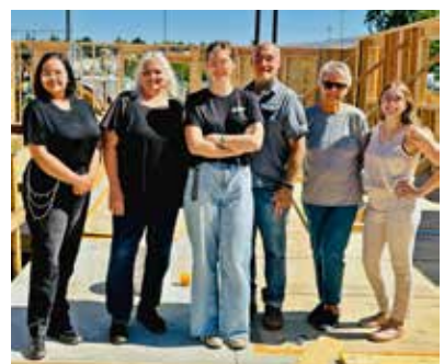
Chelan Valley Hope staff are pictured at the construction site of the nonprofit’s new building.

Chelan Valley Hope is moving into a new building with more office space