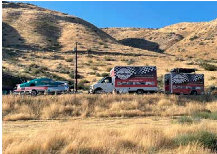
The Crazy Eights, a 2.5 stock/mod boat owned by Jade and Les Detherage, and a PNBRA truck and trailer have been parked on the Malmo property along Highway 97 between Brewster and Pateros.