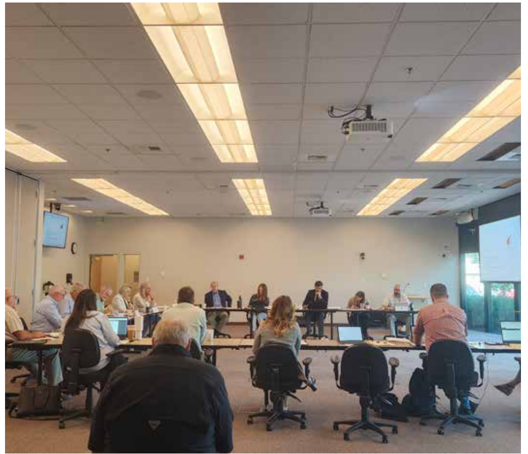
The CDRPA Board discusses Pangborn Airport’s ground transportation needs, considering a variety of different options.

Will Nilles: (509) 731-3211 or will@ward.media