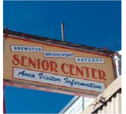
Brewster-Bridgeport-Pateros Senior Center