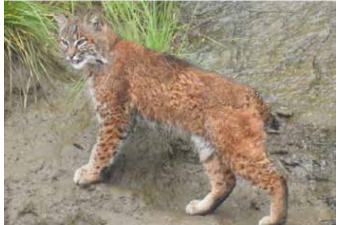
A bobcat in Washington.