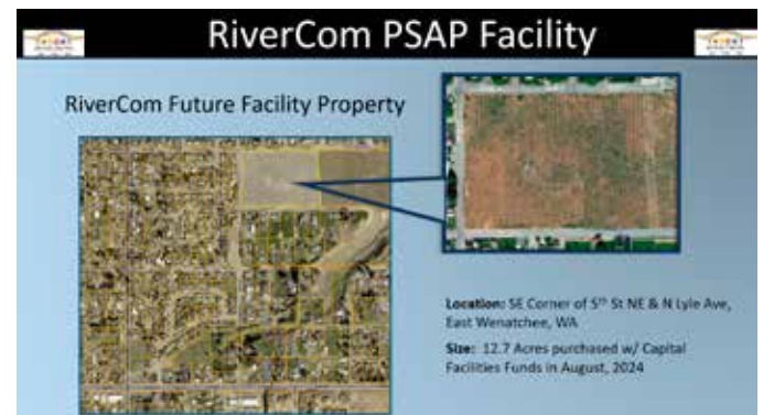
Aerial view of the 12.7-acre property purchased by RiverCom 911 for $1,422,400 in East Wenatchee, WA. The site, located at the corner of 5th St NE and N Lyle Ave, will house a new 14,000-square-foot emergency communications center to serve Chelan and Douglas counties.