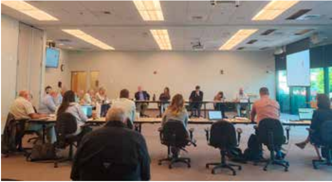
The CDRPA Board discusses Pangborn Airport's ground transportation needs, considering a variety of different options.

With Air Service Task Force strategic priorities 1 and 2 focusing on the need to recruit flight carriers with more frequent and more affordable flights, strategic priority 3 centers around a major missing piece within the local region as a whole, ground transportation to and from the airport.