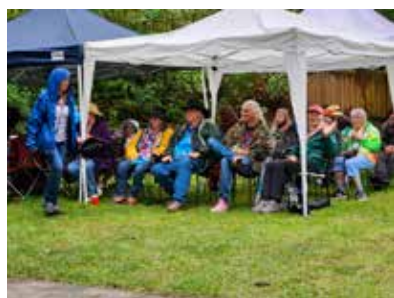
Canopy tent filled with intrepid spirits - aka - attendees of Summer of Love.