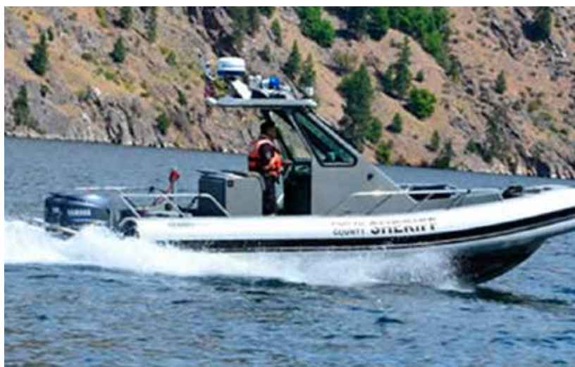
A Chelan County Sheriff's marine patrol vessel.