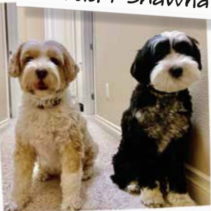
MICKEY + SADIE