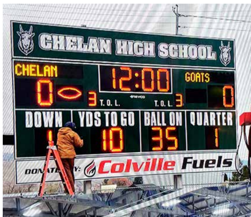
The new Goats’ football scoreboard is installed.