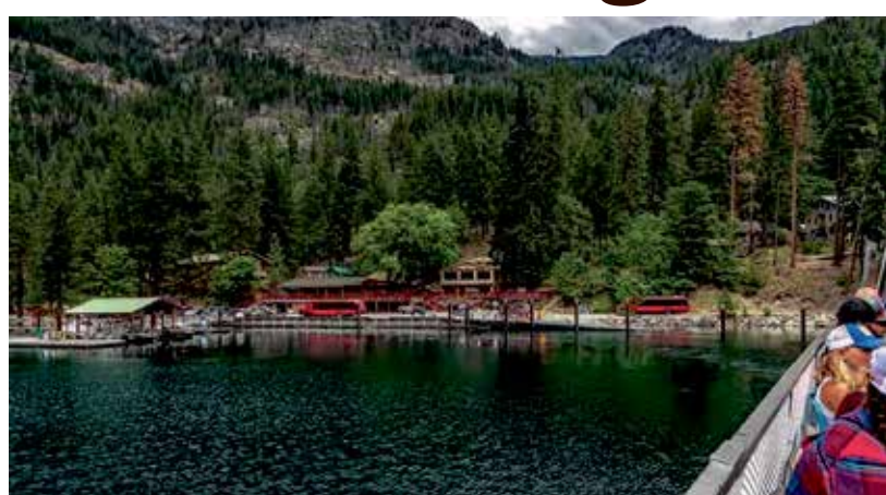
The National Park Service has reduced staff at the Golden West Visitor Center at Stehekin.

Cascades Conservation Council, the Federation of Western Outdoor Clubs, and Wilderness Watch and directed to Interior Secretary Deb Haaland and National Park Service Director Charles Sams calls on the NPS “to commit to fully staff Stehekin with rangers this summer, keep the Golden West Visitor Center open, and continue providing these services as the Park has done for the last 55 years.” A spokesperson at Stehekin advised that while the visitor center will be closed, information and interpretive materials will be posted online and on the bulletin boards and waysides throughout the valley. Camping reservations and backcountry permits will be issued. Maintenance, services, and wilderness/fire staff will rotate through the area. The petition further states that “the decision by the National Park Service to abandon Stehekin is a betrayal of Congress’s intent in as-