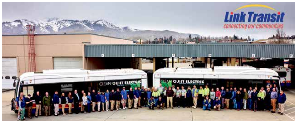
Link Transit staff members pose in front of two of their clean quiet electric busses.