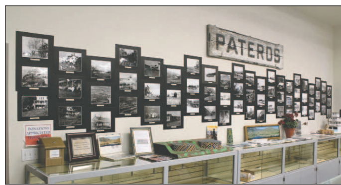
A large array of mounted photos reflects life in and around early Pateros

The next meeting of the Museum Committee is at 2:30 p.m. Thursday, March 2 at City Hall.