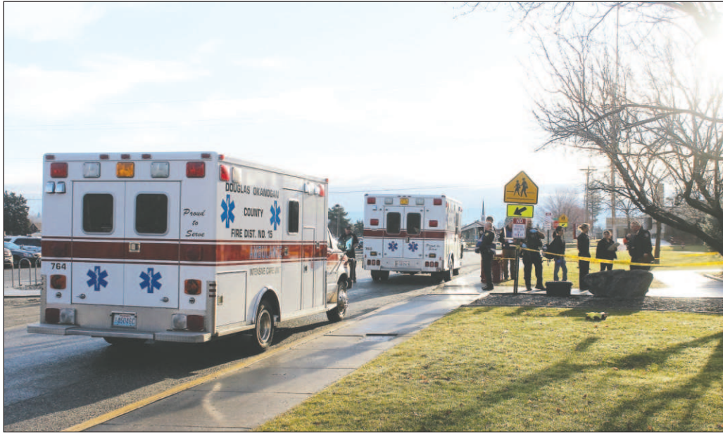
Story and photo by Mike Maltais Douglas Okanogan County Fire District 15 ICU ambulances stood ready to transport "casualties" to Three Rivers Hospital.