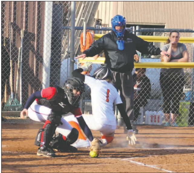
...and scores the go-ahead run that gives the Bulldogs the lead, and the game, 7-6.