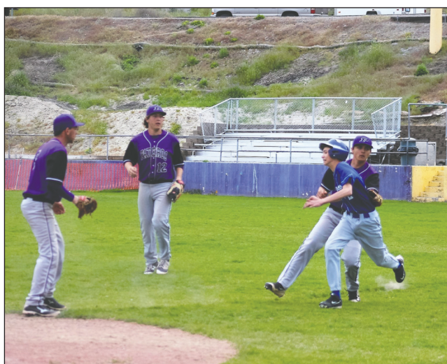
...and makes the tag for the out. See page 5 for story