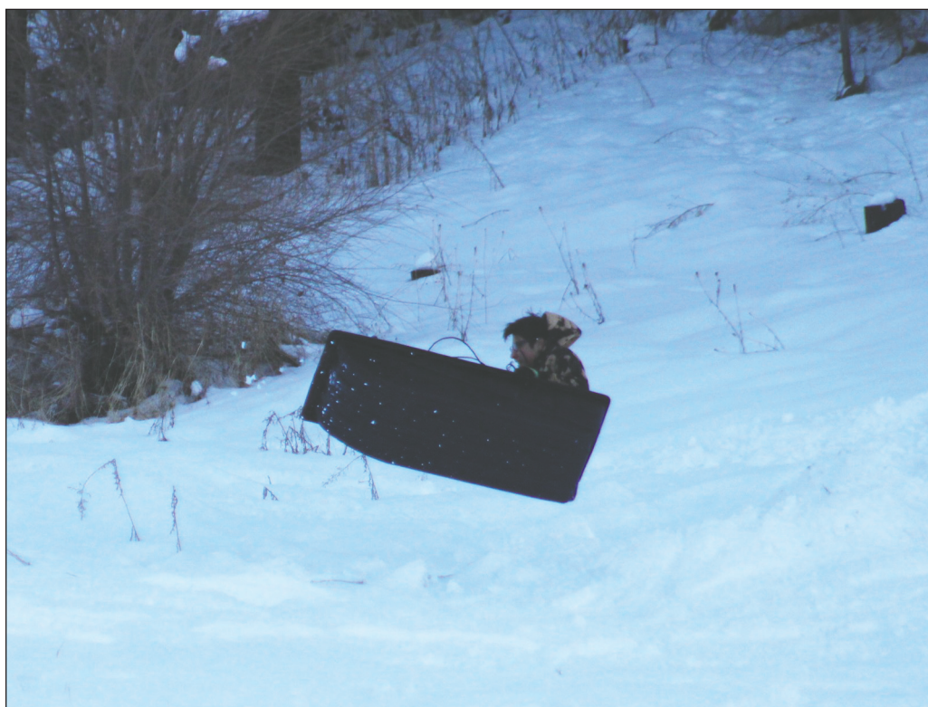
...and it's time to abandon ship.