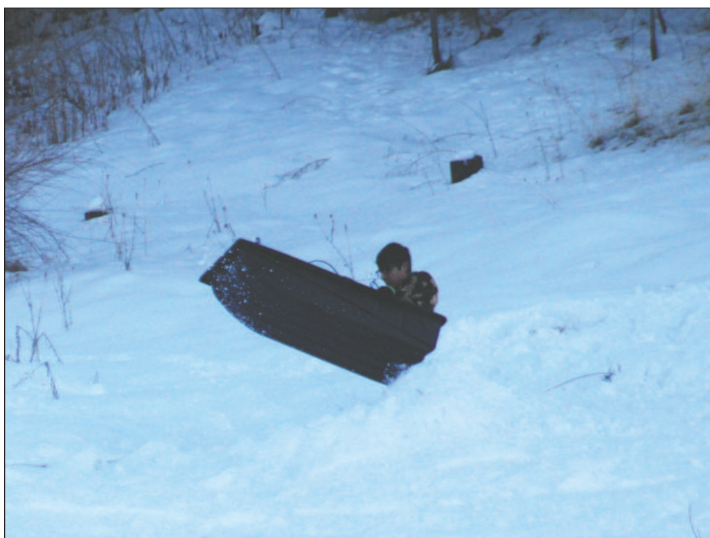
When everything shifts to starboard during flight over a jump...

Jan. 30 Suspicious incident at 944 Fairview Ave. in Bridgeport. Hazard at State Route 173 and Crane Orchard Road on Bridgeport Bar.