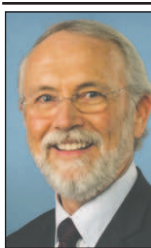
U.S. Cong. Dan Newhouse

While marchers gathered outdoors, inside the House of Representatives, work was being accomplished on pro-life legislation. The House was debating H.R. 4712, the Born-Alive Abortion Survivors