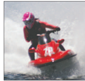
NW Jet Sports Association draws nearly 50 racers to APJ See page B2