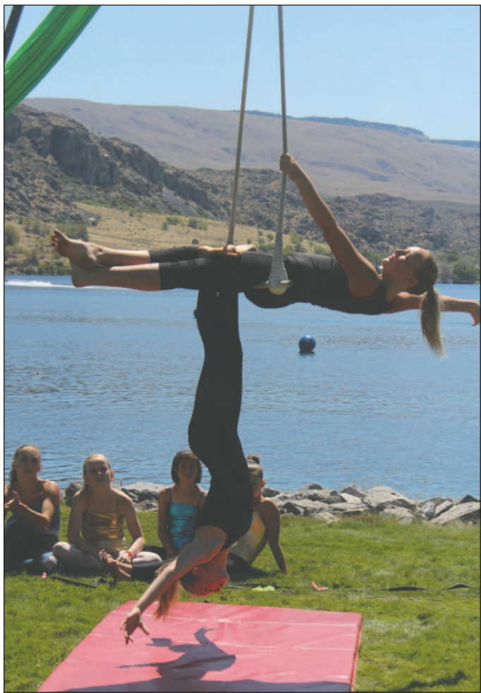
Aerialists, dancers, and singers entertained the crowd.

The Northwest Jet Sports Association Watercross competition started at 12 noon on Saturday and ran the finals the following day. (See separate story) The Ray Stanley Memorial Bass Tournament, 5K and 1K Color Run, vendors, food, and fireworks left everybody ready for the work week so they could rest up.