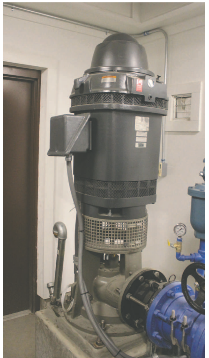
Flip my switch, Will Robinson... Looking not unlike "Robot" in the mid-1960s TV series Lost in Space, the pump in Well Station 3 was ready to go to work as the hour approached to bring the new water system online.

the culmination of four years of infrastructure restoration and repair that began after the July 2014 Carlton Complex wildfire devastated parts of the city. Along the way the city has garnered numerous awards for meeting high standards for water quality and treatment.