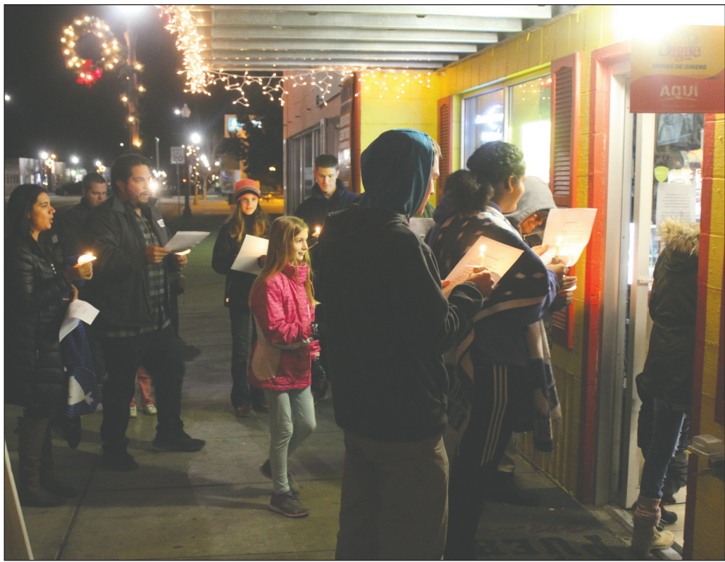
The traveling carolers made their first stop at Mi Pueblo before heading down both sides of Main Street toward their ultimate destination at the Senior Center.