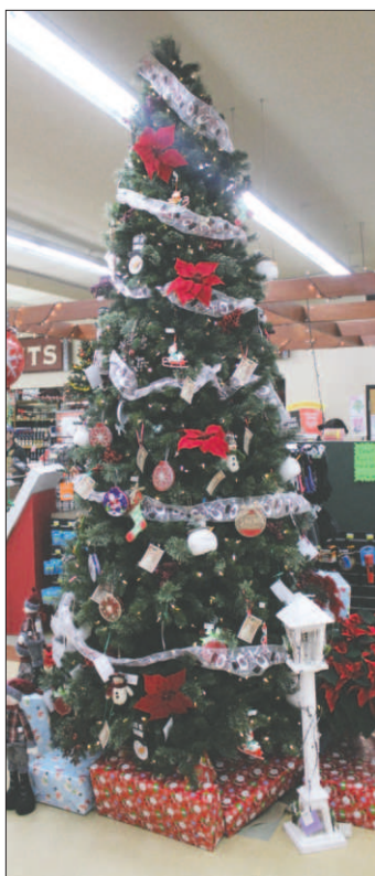
The Christmas tree on display inside Brewster Marketplace is decorated with donation tags for the Brewster-Pateros-Bridgeport Senior Center and the Brewster Food Bank.

BBGC is partnering with the Washington State Department of Transportation (WSDOT) to host Family Night from 5:30-8 p.m., Tuesday, Dec. 18. The event will include dinner, guest speakers, and community roundtable discussions that will focus on the topic: How do you get where you need to go on time and affordably? How could it be better? Visit WSDOT's website at www.athenaplace.com/wsdot to learn more. For information