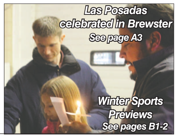
Las Posadas celebrated in Brewster See page A3