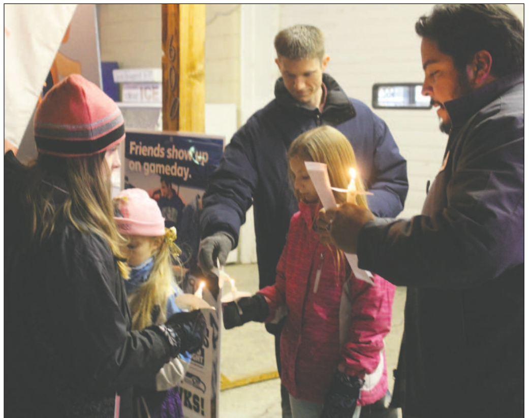
Las Posadas carolers gathered in front of The Armory on Brewster's Main Street and lit candles before setting off on the multi-stop journey to area businesses.