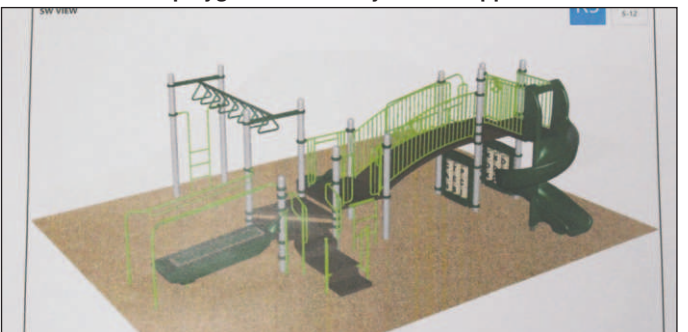
Draft courtesy of Brewster City Council

This concept draft shows what the completed Brewster playground will look like viewed from the southwest across from the Brewster Boys and Girls Club.