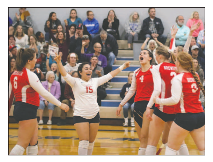
Brewster players celebrate their league title win over Manson.

The SOD recognizes the top five percent of schools as the highest improving schools in Washington state and celebrates school staff, students and leaders who improve performance for all students over a sustained period in reading/ English language arts and mathematics at the middle school level and graduation rates at the high school.