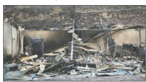
The "Smoke and Mirrors" Fire Maze Display provides an in-depth look at what a major

Floats, classic cars, political candidates, water blasters, horses, flags, balloons and lots and lots of candy made the 45-minute procession appear longer in length and du-