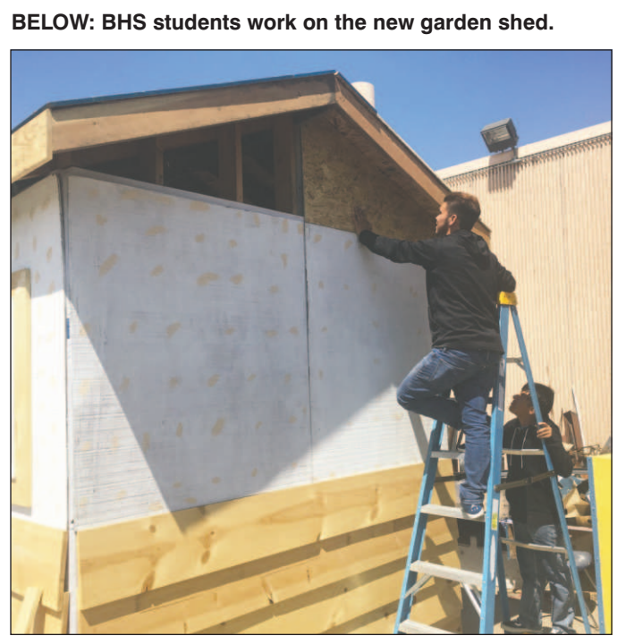
BELOW: BHS students work on the new garden shed.