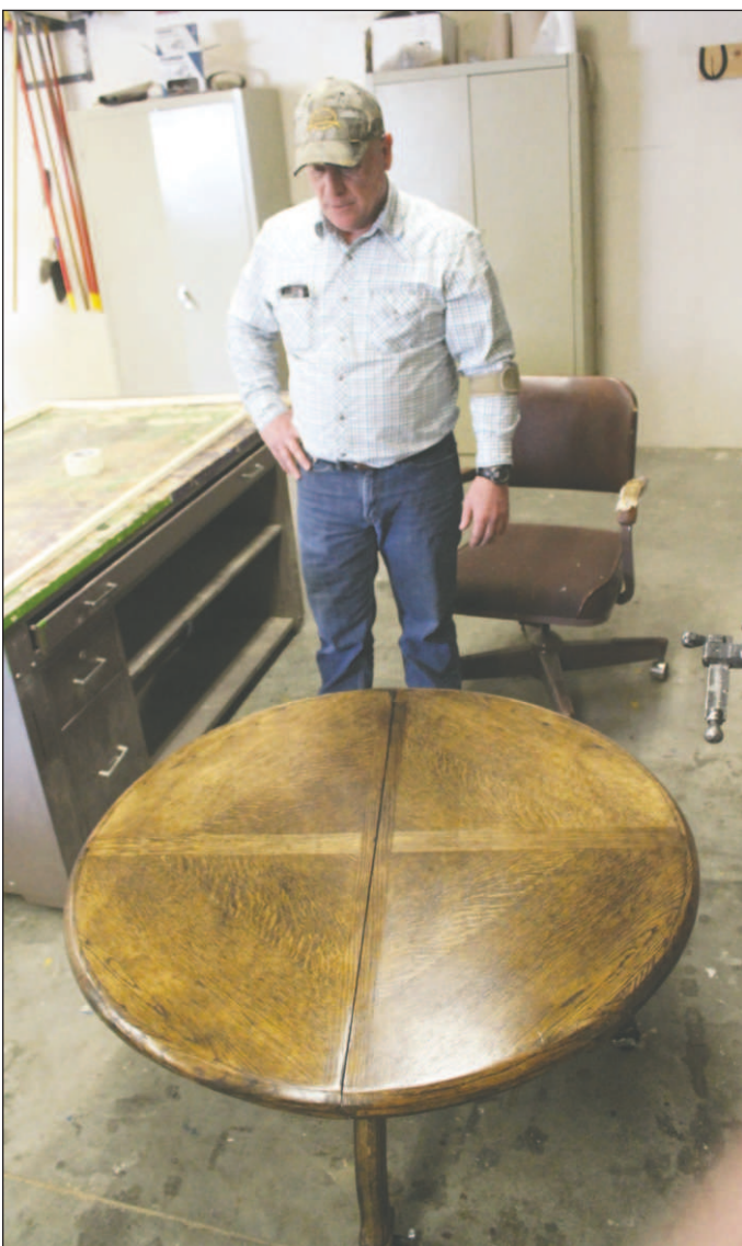
Shop students modified this dining table by lowering it to the height of a coffee table for a client.

The Pateros FFA students are effective fundraisers with their barbecue grill a regular fixture at many of the community events in their town. The group also collects aluminum cans at recycle bins located in town and at nearby Alta Lake.