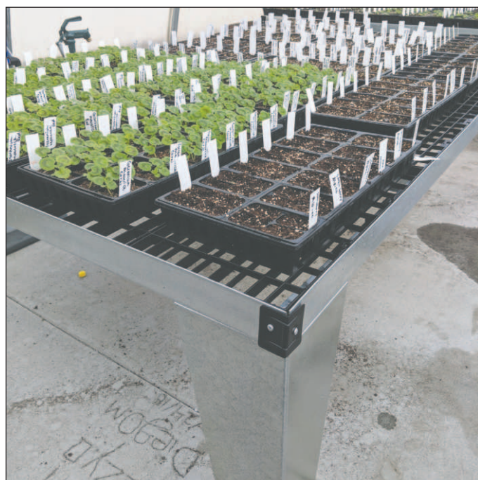
A shot of the new plantings in the Bridgeport High School greenhouse shows a portion of the new concrete floor added this year thanks to a grant from Career and Technologies Education.