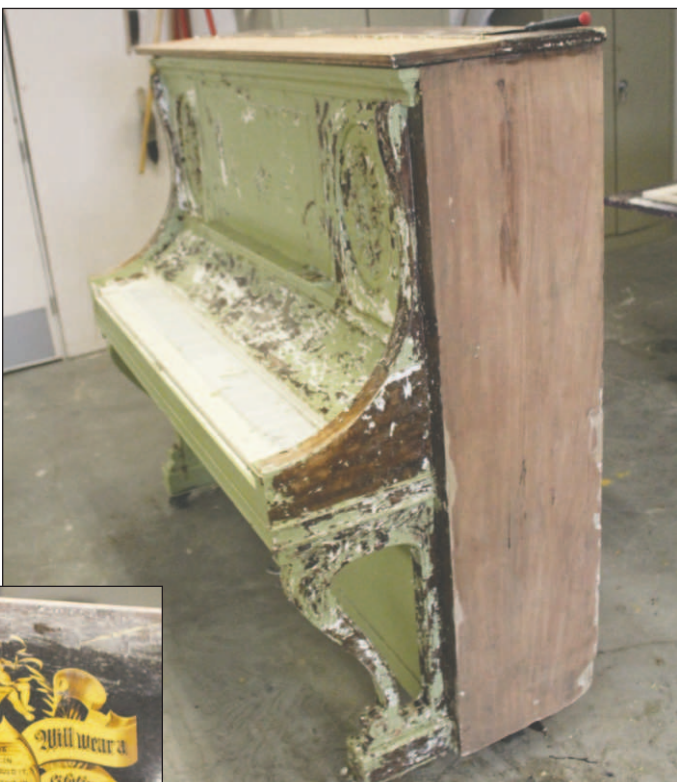
ABOVE: A delicate woodworking project is restoring the original wood finish on of this Ludwig & Co. upright piano. LEFT: The Ludwig logo