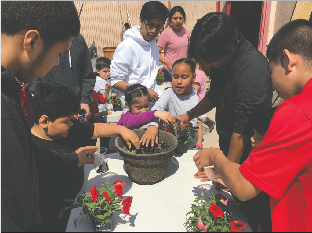
Through the Greenhouse Buddy Partnership, students share their skills and experience with a group of kindergarteners.

Students are also putting the finishing touches on a new garden shed that will help accommodate the school's ambitious horticulture operation.