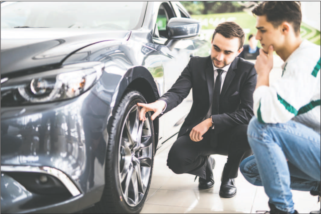
Having the right insurance coverage will provide peace of mind and make that new car ownership experience that much more enjoyable.