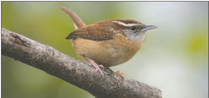
Add beauty to your yard with a wooden bird house. The birds will love it.

Although decks are generally a mild-weather attraction, there are many ways to make an outdoor living space functional and enjoyable during the rest of the year, regardless of the geographic location. Transform a deck into an all-seasons sanctuary through the use of special features and beautiful low-maintenance composite decking to make the most of the beauty of the outdoors without sacrificing the comfort and style of your unique outdoor retreat.