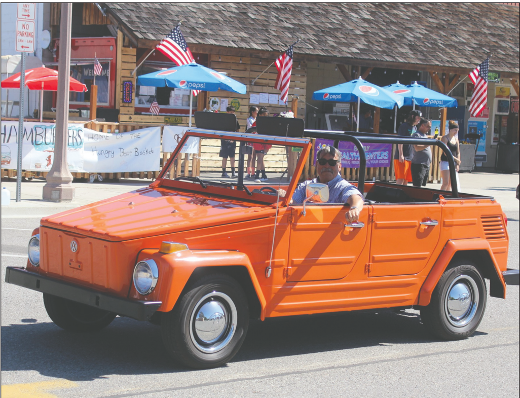
Al Shelly's 1973 VW Thing was the pick in the Modern category.