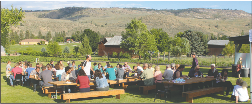
Volunteers, supporters and beneficiaries connected with the completion of OCLTRG houses east of Omak gathered for a BBQ dinner at Smallwood’s Farm south of Okanogan last Friday, June 21 to celebrate the dedication of two of the final Phase Three homes.