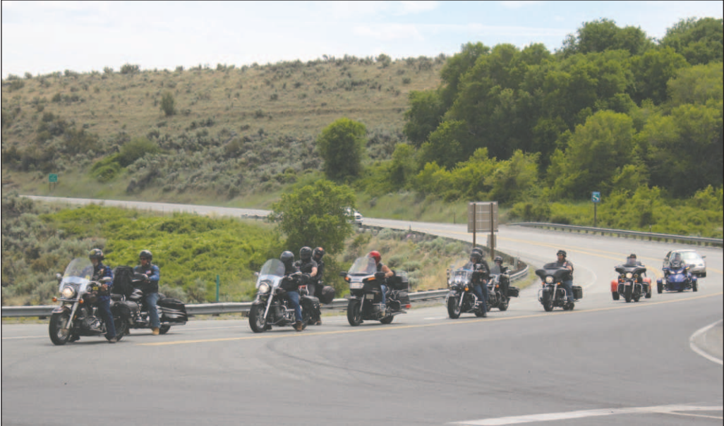
The convoy of Legion Riders pauses for oncoming traffic before turning onto Foster Creek Avenue from State Route 17.