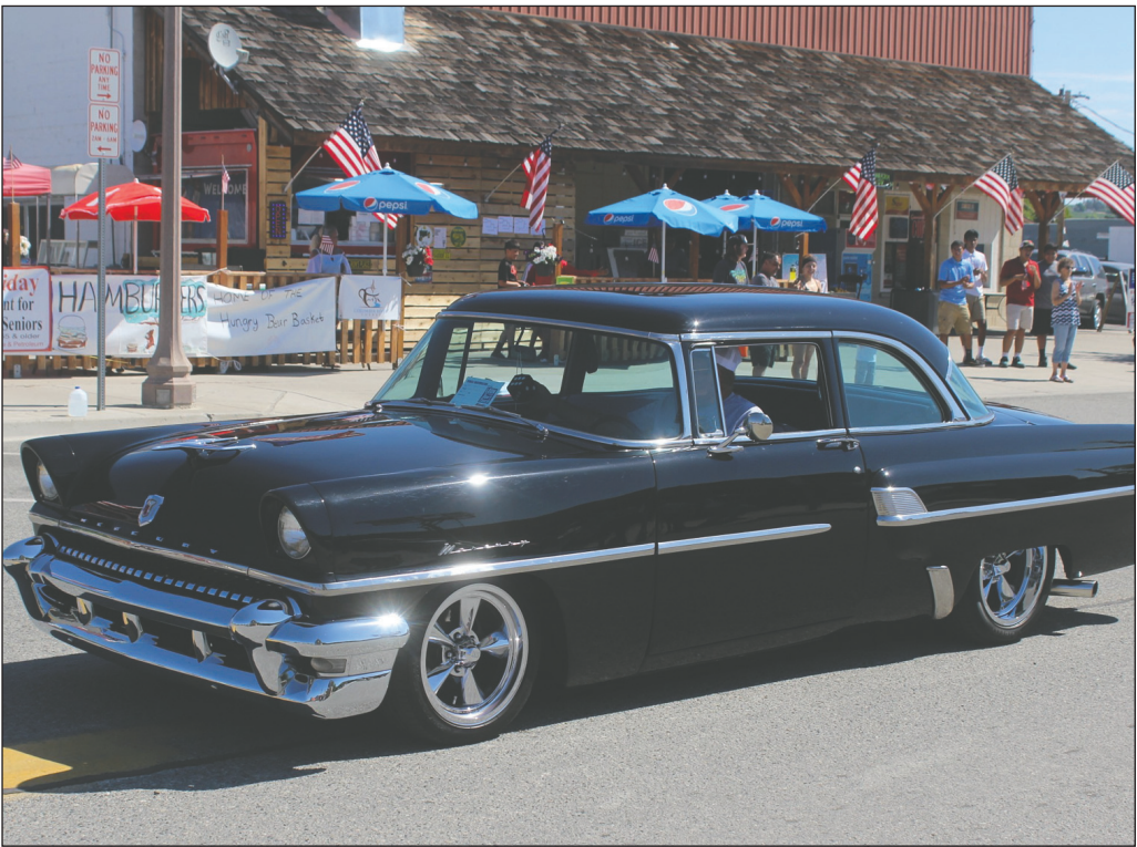
This 1955 Mercury Custom was the favorite for 1940-59 vintages.