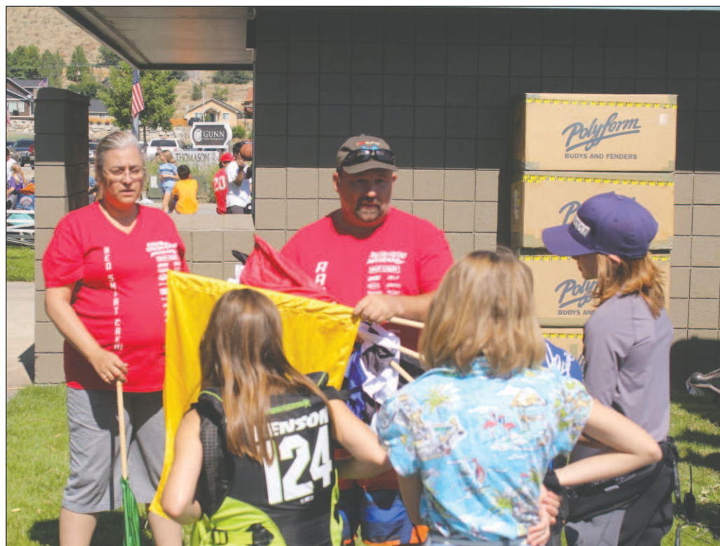
BY MIKE MALTAIS STAFF WRITER

PATEROS – The Northwest Jet Sports Association debuted its 2019 racing season with two days of competition on Lake Pateros during the 71st Apple Pie Jamboree on July 20-21.