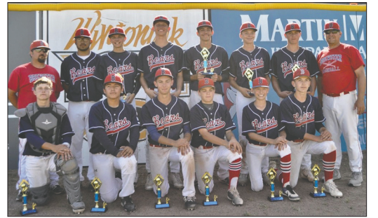
See page A3