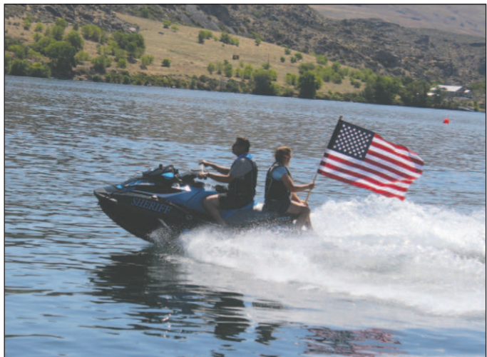
A single jet ski displays the Stars & Stripes during the playing of the National Anthem.