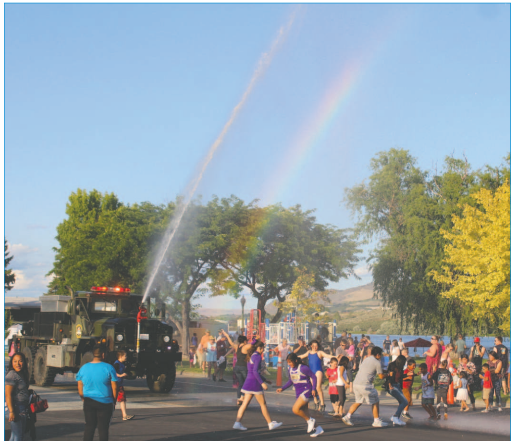
A rainbow formed alongside the jet of water cooling the crowd from the fire department water tender. More APJ photos on B1 and B2.

Saturday included all the regular events; the early morning Color Run, breakfast in the park, 3-on-3 basketball, the Ray Stanley Memorial Bass Tournament, Quilt Show and veterans quilt presentation, jet ski races, and fireworks.