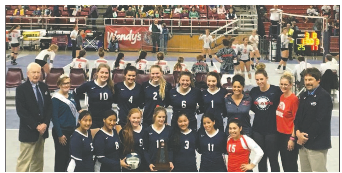
The Lady Bears captured fifth place at state last year.