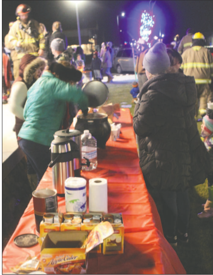
A refreshments table provided free snacks and beverages for visitors.