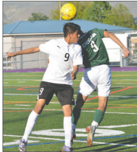
AI Stover/NCW Media