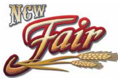
NCW Fair