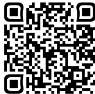
Scan this QR code to go directly to the survey

Okanogan County offers a unique and attractive quality of life that has both sustained its existing population and attracted new-comers from