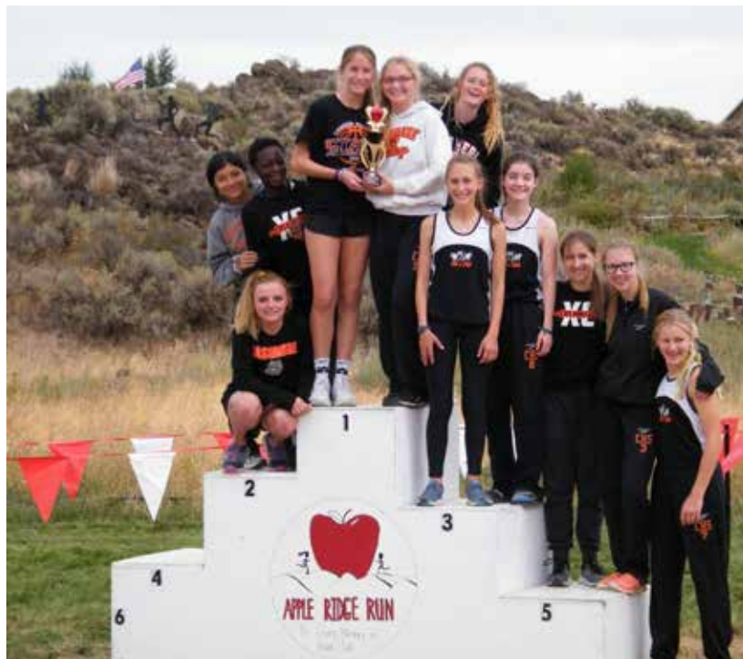
The girls "Small School" champion team for the second season in a row.