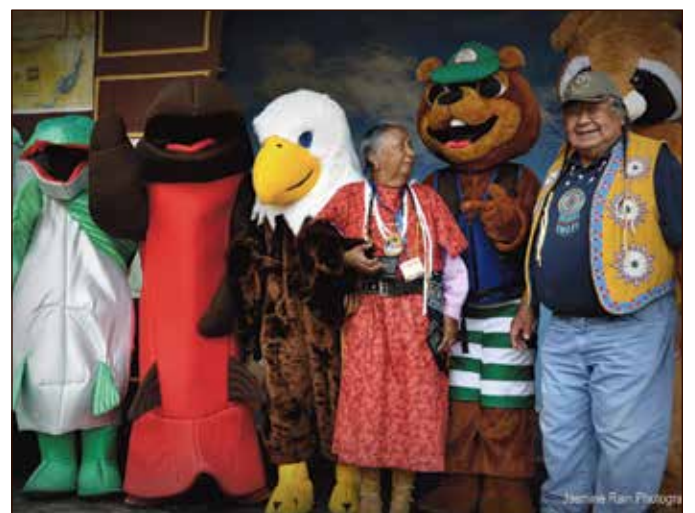
ABOVE: Salmon Festival characters with members of the Native American tribes.

LEFT: In this colorful 30-foot long nylon inflatable Salmon Tent, audiences will be entertained with a variety of meaningful stories. It's entertainment for the whole family in a unique setting.