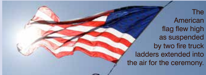
The American flag flew high as suspended by two fire truck ladders extended into the air for the ceremony.