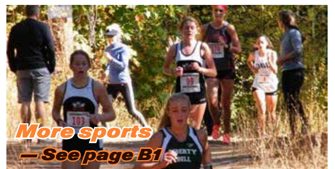
More sports — See page B1

OCTOBER 10, 2018 • VOLUME 111, No. 41 SINGLE COPY $1.00