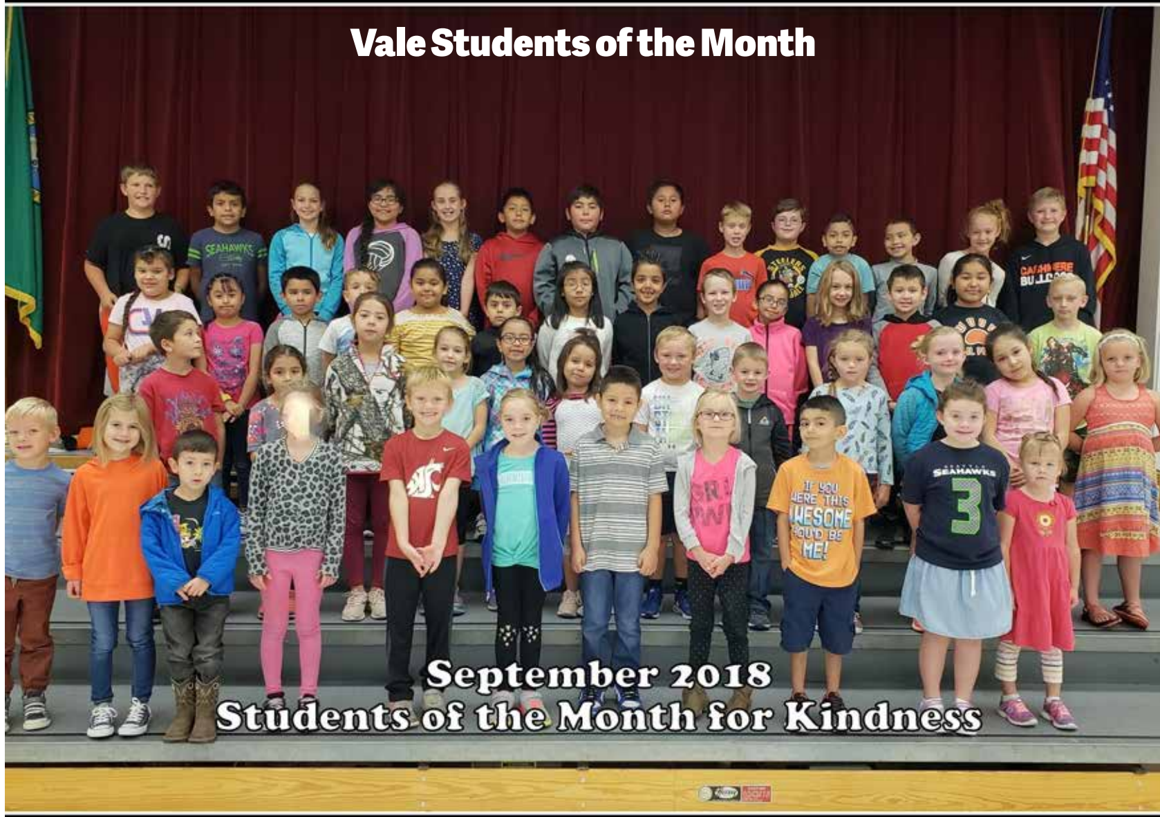
September 2018 Students of the Month for Kindness