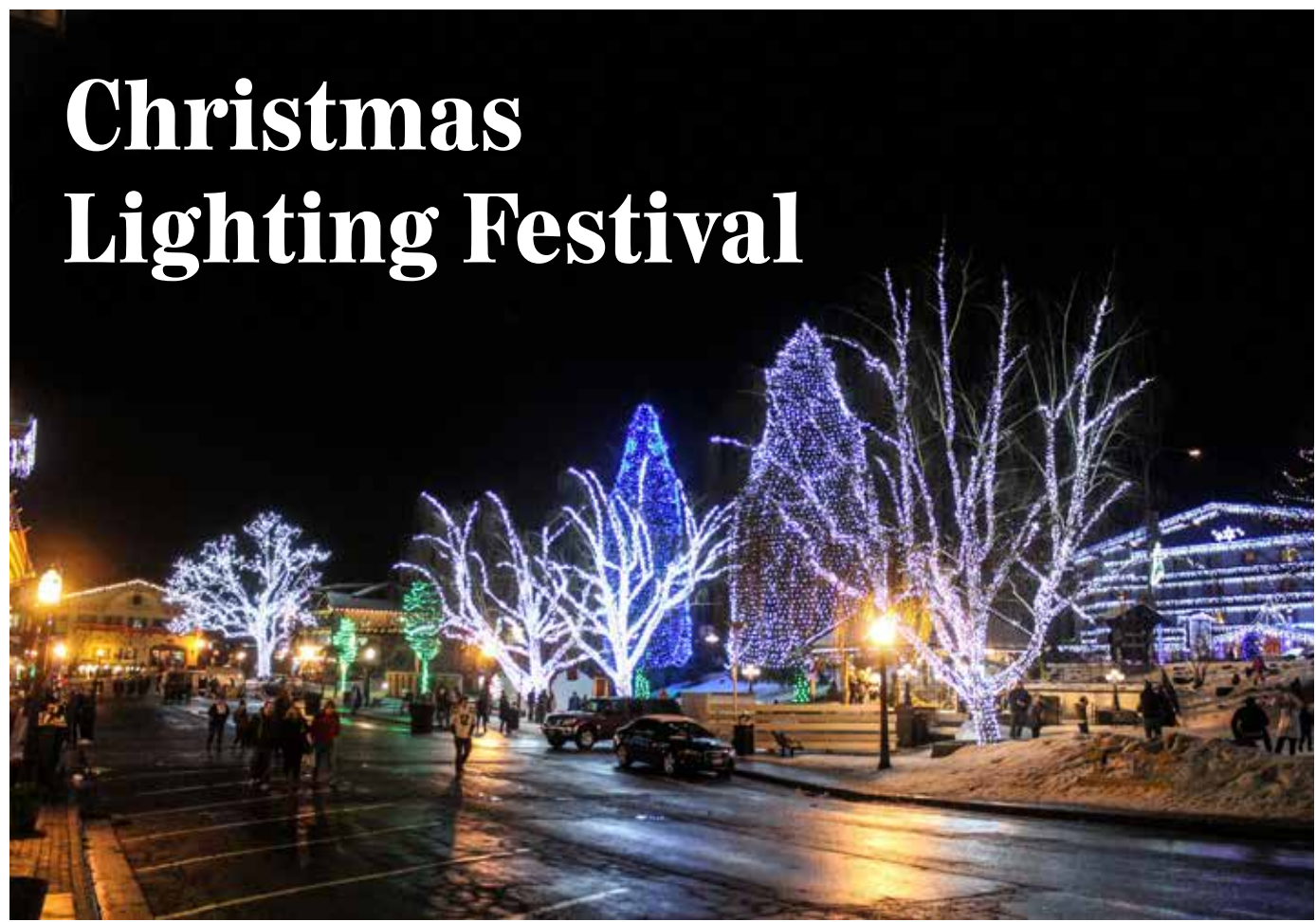
By KALIE DRAGO Echo Reporter

With the incoming snowy weather and incoming herd of tourists, it's clear that is about that time again for the city of Leavenworth to host their annual three weekend Christmas Lighting Festival. Transitioning out of the usual Bavarian Village into a Village of Lights, the city celebrates the upcoming holiday season. Starting Friday, November