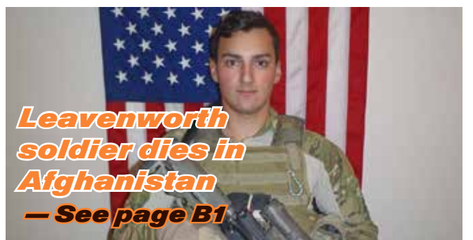
Leavenworth soldier dies in Afghanistan — See page B1

NOVEMBER 28, 2018 • VOLUME 111, No. 48 SINGLE COPY $1.00