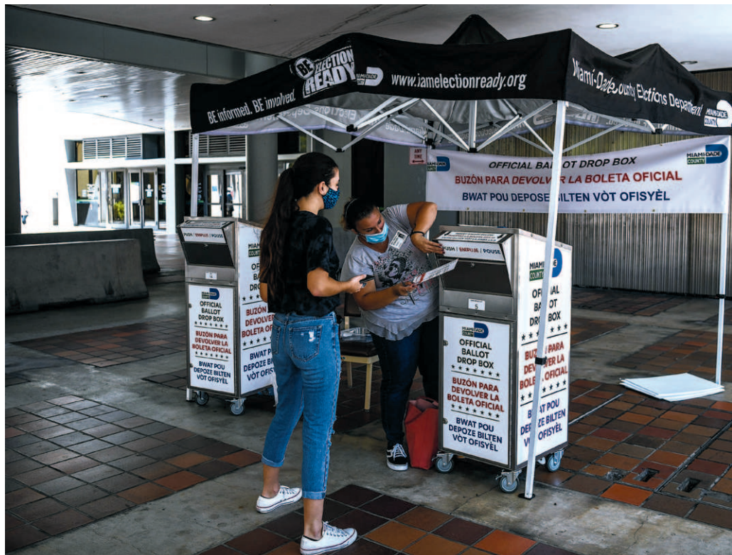
A poll worker helps a voter to post her mail-in ballot in an official Miami-Dade County ballot drop box in Miami on Aug. 18, 2020.

Meanwhile, the other lawsuit was filed by NAACP Legal Defense and Educational Fund (LDF), Disability Rights Florida, and