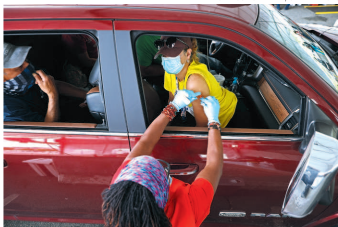
A woman receives her first dose of the Pfizer COVID-19 vaccine at a mass vaccination site at Ripken Baseball in Aberdeen, Md., on May 5, 2021.

The two companies announced on May 7 that they initiated a rolling submission for a biologics license application by submitting nonclinical and clinical data, including the most recent analyses from a phase three clinical trial, to the Food and Drug Administration (FDA) in the coming weeks.