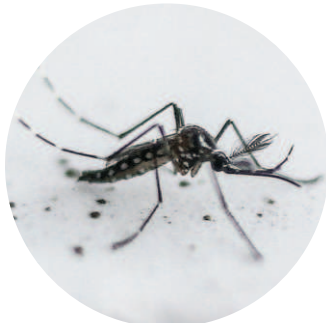
A transgenic Aedes aegypti OX513A mosquito, created by Oxitec, in Piracicaba, Sao Paulo, Brazil, on Oct. 26, 2016.

The experiment is in collaboration with the Florida Keys Mosquito Control Dis-