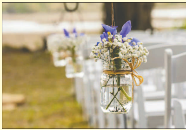
Companies across the country collect flowers after weddings and repurpose them for delivery to nursing homes and shelter facilities.

One of the most meaningful steps you can take is to enlist the services of Earth-friendly vendors. These businesses are committed to following environmentally sound processes when