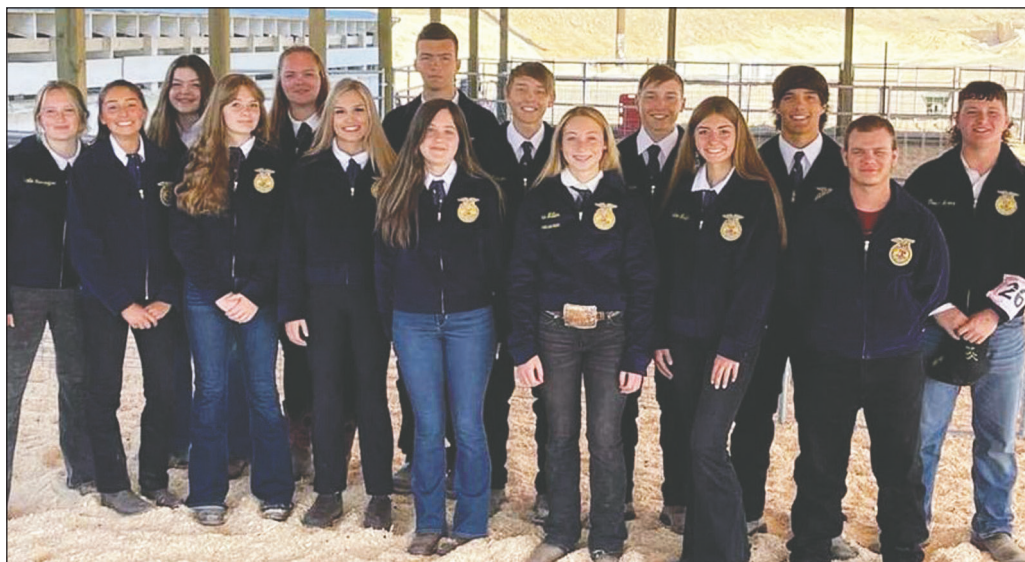
The Mansfield High School FFA class had a good time and won their share of awards at the NCW Fair last month.