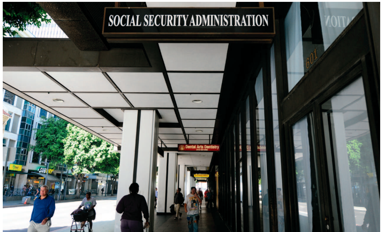
Pedestrians walk past the Social Security Administration office in downtown Los Angeles, in this file photo.

"Yesterday's reports on the financial status of various Medicare and Social Security trust funds once again identify unsustainable benefit promises in Medicare and Social Security programs," Sen. Mike Crapo (R-Idaho) said in a statement