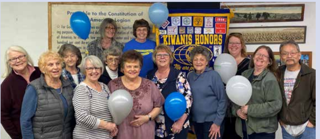
Wacoka Kiwanis Club

The Cashmere Chamber of Commerce is a non-profit membership association whose purpose is to promote economic vitality for growth or betterment of the community. All honorees were chosen in February by a review committee of their peers following a community-wide nomination process in January.