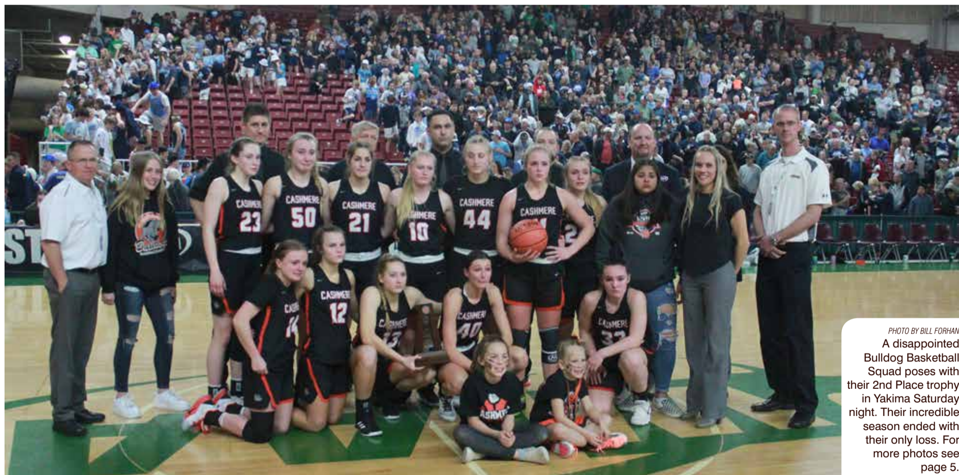
A disappointed Bulldog Basketball Squad poses with their 2nd Place trophy in Yakima Saturday night. Their incredible season ended with their only loss. For more photos see page 5.