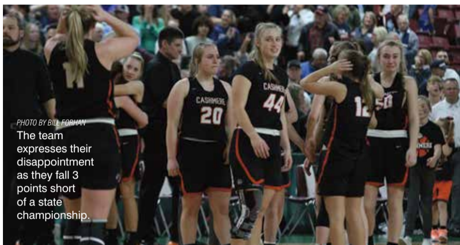
The team expresses their disappointment as they fall 3 points short of a state championship.