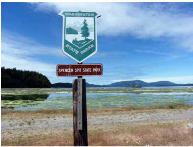
Spencer Spit State Park

At Olympic National Park there are nearly a million acres of land to explore, much of it rainforest, along with 70 miles of coastline. However, all visitor centers are closed and both the