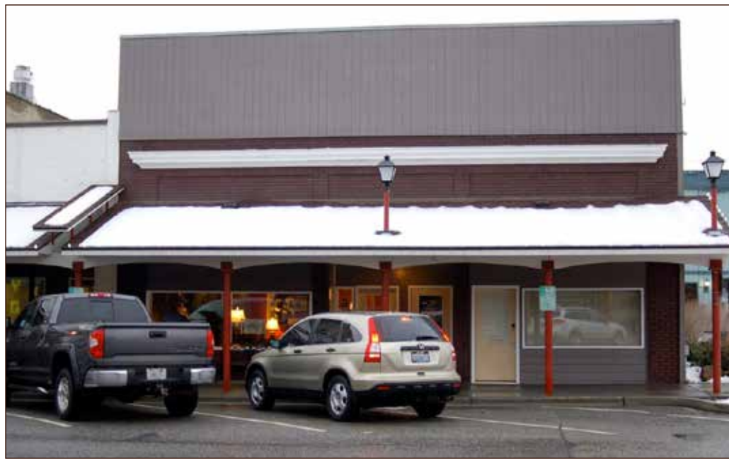
Pratt Building today