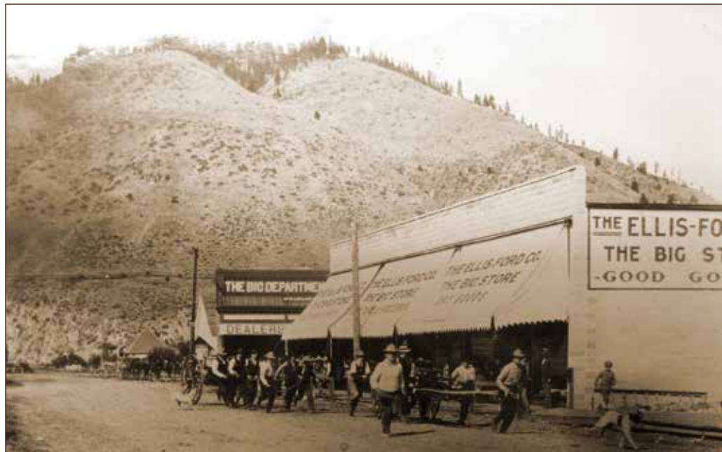
1910 Fire Department Drill in front of Ellis Forde Building.