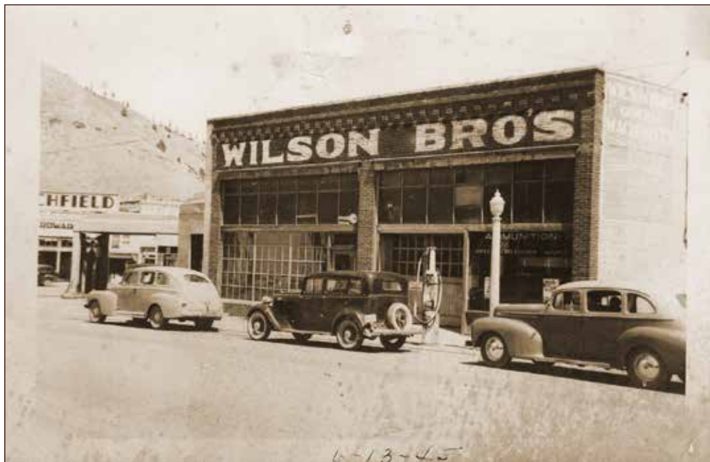
Wilson Brothers Garage and Machine Shop 1945