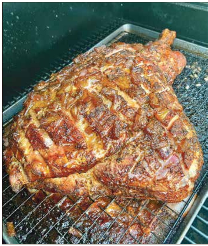
Bourbon Pineapple Glazed Ham

never use regular ice again: Prep time: 30 min Freeze time: ~ 4-5 hours