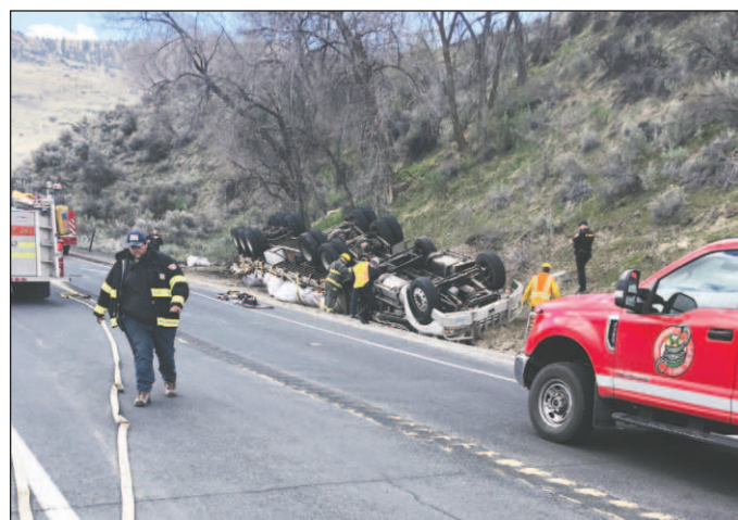
A semi truck hauling a non-hazardous material left McNeil Canyon Road on April 4 and overturned, killing the driver, a 57-year-old man of Spokane.