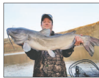
A big channel catfish caught at the mouth of the Palouse River

season kicks off Friday, April 15 and the best place to go is Northeast Washington where more gobblers are harvested than anywhere else. If you are looking for public lands to hunt on biologists with the Washington Department of Fish and Wildlife suggest trying the LeClerc Creek and Rustlers Gulch Wildlife Areas. Other places with good turkey populations are near the Blue Mountains of Southeast Washington where the W.T. Wooten, Asotin Creek and Chief Joseph Wildlife Areas could be good hunting destinations. And then there’s Klickitat County. This is an overlooked destination by many but locals do quite well around here. You’ll find Klickitat gobblers on private timberlands around the Simcoe Mountains but you’ll want to contact those timber companies and find out what the process is to access them. If that’s too much bother the Klickitat Wildlife Area offers a decent public land opportunity.