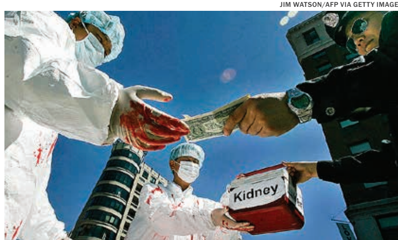
Falun Gong demonstrators dramatize an illegal act of paying for human organs during a protest in Washington on April 19, 2006.

doctors were still intubating the donors after pronouncing the purported brain death or immediately before the surgery. In some cases, the donor was ventilated by a face mask, indicating that no brain death assessment had taken place.