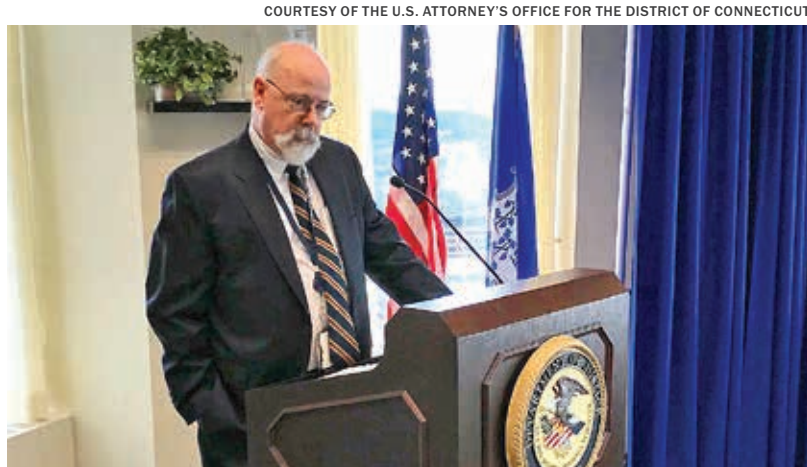
John Durham speaks at a conference in New Haven, Conn., on Sept. 20, 2018.

Sussmann and his lawyers have been pressing the judge to dismiss the case prior to trial, arguing that the lie about not bringing the information on behalf of a client wasn’t material to the information itself.