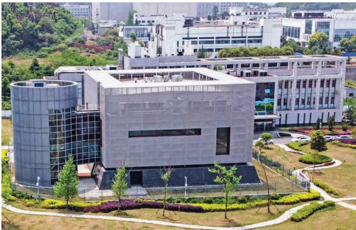
The P4 laboratory at the Wuhan Institute of Virology in China’s central Hubei Province on April 17, 2020.

On June 16, 2020, NIH officials reversed themselves and deleted the genetic sequencing data, as requested by the Wuhan researcher. That researcher was quoted by EO as explaining to NIH: “Recently, I found that it’s hard to visit my submitted SRA data, and it