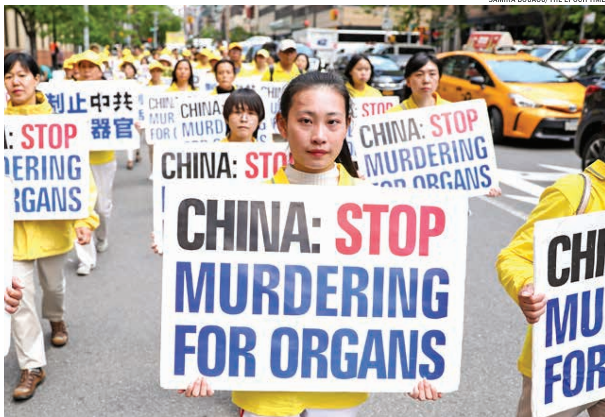
Falun Dafa parade in New York on May 16, 2019.

In reaching its finding, the body, known as the "China Tribunal," rejected claims by the Chinese regime