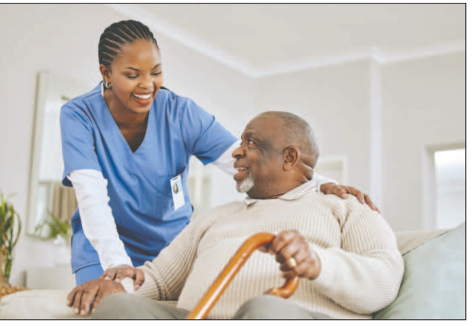
Home health nurses work with people of all ages, including newborns and children.

Fact: Home health nurses work with people of all ages, including newborns and children. They offer a wide variety of services, from specialized personal care for children with disabilities to management for those who