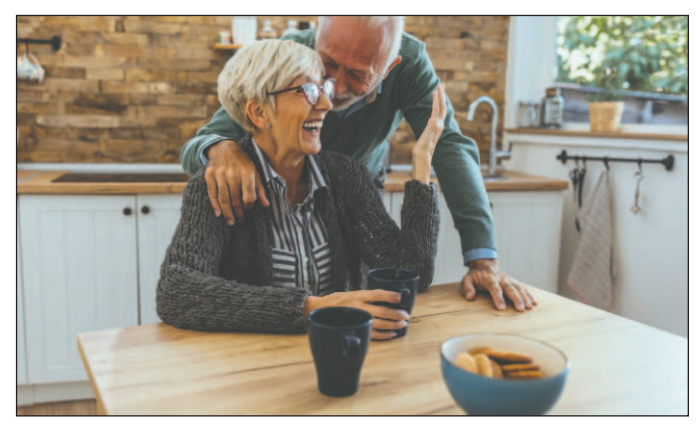
Almost a quarter of the American population will be over the age of 65 by 2030.

According to experts, Artificial Intelligence (AI) and Machine Learning (ML) are already among the key components of new technologies providing improved quality of life for those who want to continue living independently at home.