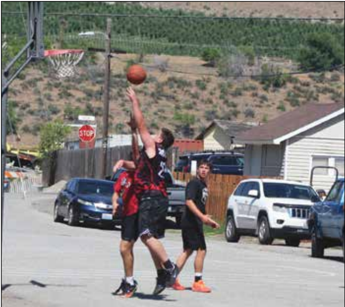
Three-on-three basketball drew teams to the weekend event.