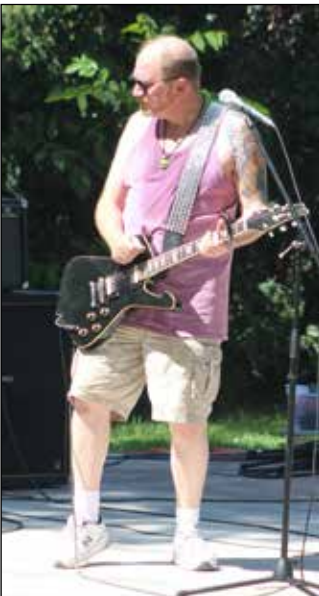
A member of the band Coventry strikes up the music in Fireman Park during Bridgeport Daze.