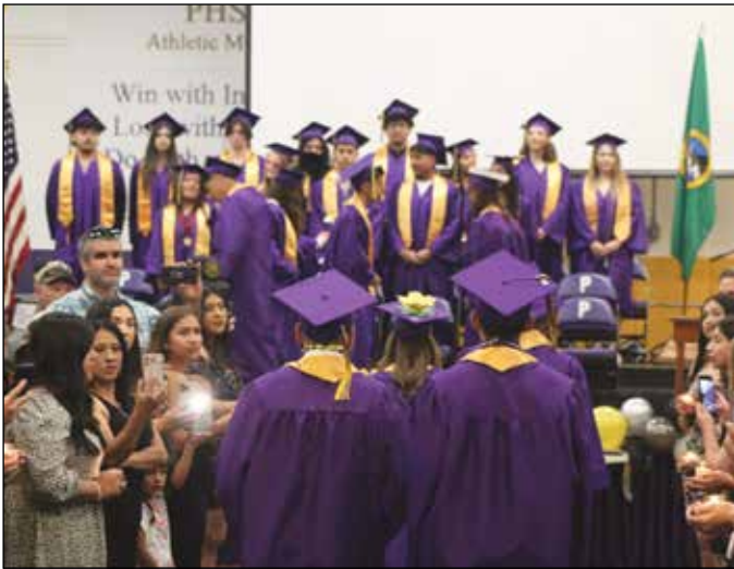
Pateros seniors approach their seats