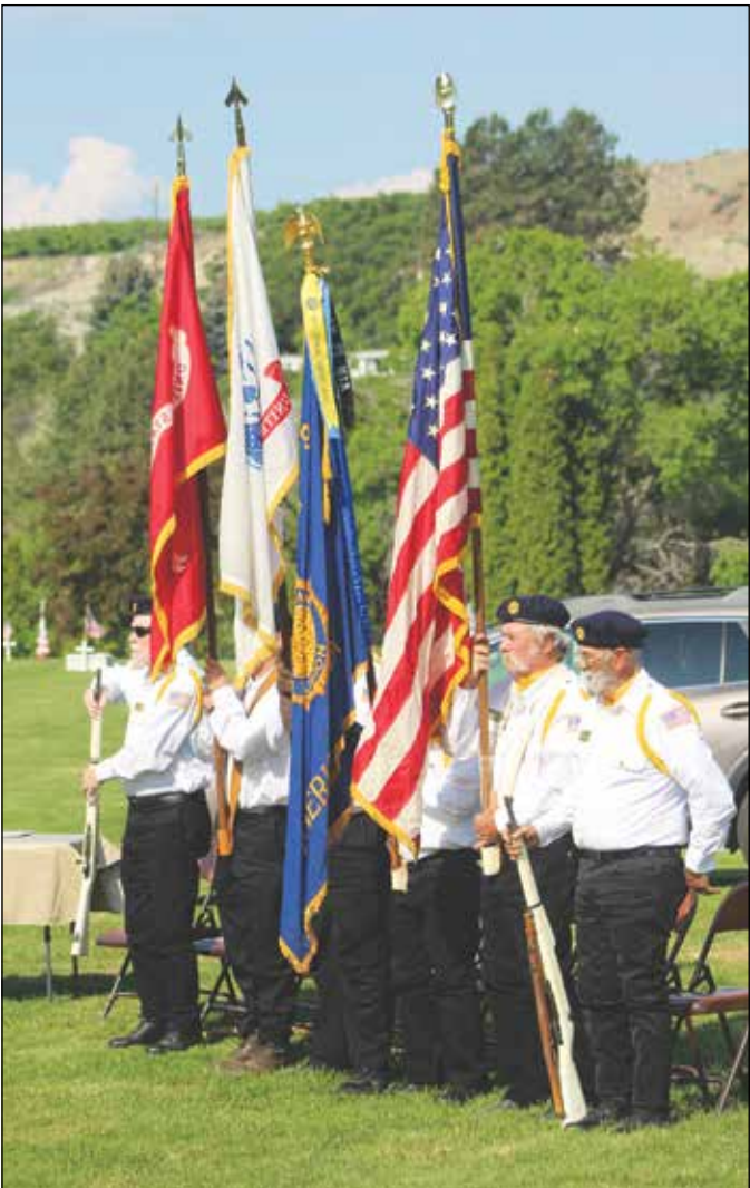
The Brewster American Legion Post 97 honor guard posts the colors.