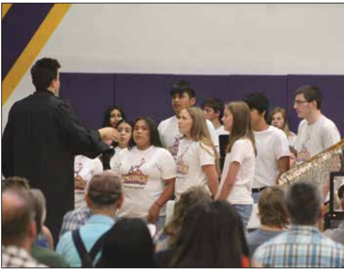
The Pateros choir sang “We Go Together”.