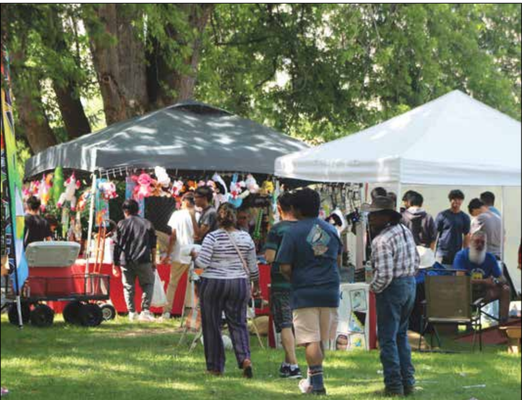
Vendor turnout was good as more than a dozen set up in Fireman Park.

"We have to go to all the venues to make sure everything is done properly," said