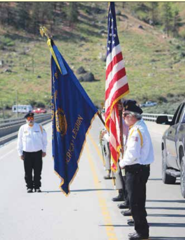
Among the stops at five cemeteries in Pateros, Brewster, and Monse on Memorial Day, the Honor Guard from American Legion Columbia Post 97 visited the Bridge Street Bridge and Fort Okanogan Memorial Cemetery near Monse.