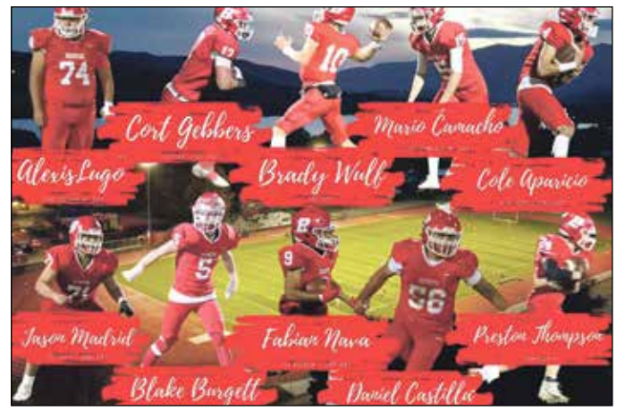
Brewster Bears made the 2023 All-League teams 10 strong.