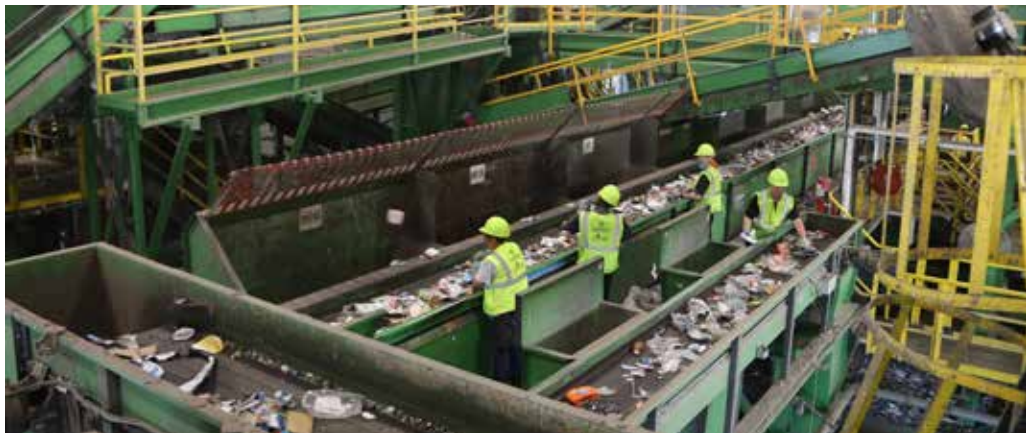
SMaRT Center sorting line.

As an example, did you know that even our large blue curb side recycling bins supplied by Waste Management are made from recycled materials?