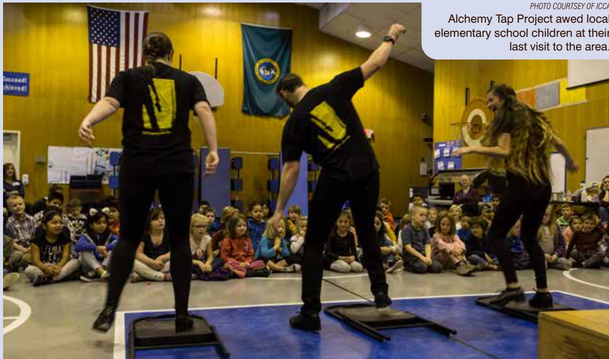
Alchemy Tap Project awed local elementary school children at their last visit to the area.

Other visiting artists also hail from the Pacific Northwest,