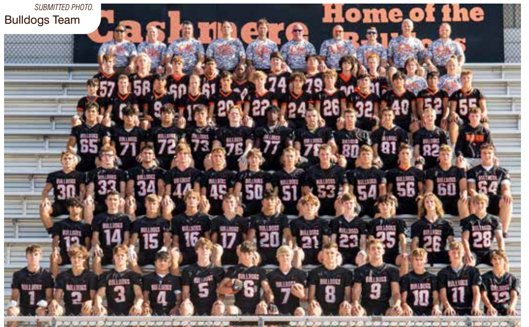
SUBMITTED PHOTO. Bulldogs Team