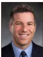
COMMUNITY VOICES By BRAD HAWKINS

The Washington State Legislature meets each January but alternates between longer sessions of 105 days in odd years and shorter sessions of 60 days in even years. This year, the Legislature will convene on January 9th for a 105-day session. The primary focus will be developing the operating, transportation, and capital budgets for the 2023-2025 biennium. In addition to developing new state budgets, committees will conduct hearings and the Legislature will debate and update various laws. After two years of COVID pandemic "hybrid" sessions with only partial in person activities, the upcoming session is expected to return to more standard operations. Here is a review of each of the state budgets, including their 2021-2023 approved amounts: