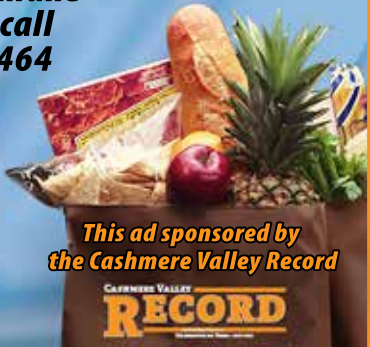
This ad sponsored by the Cashmere Valley Record

Or you can write a check to: Cashmere Food Bank, PO Box 225, Cashmere, WA 98815